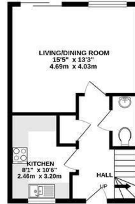
1ST FLOOR 371 sq.ft. (34.5 sq.m.) approx.